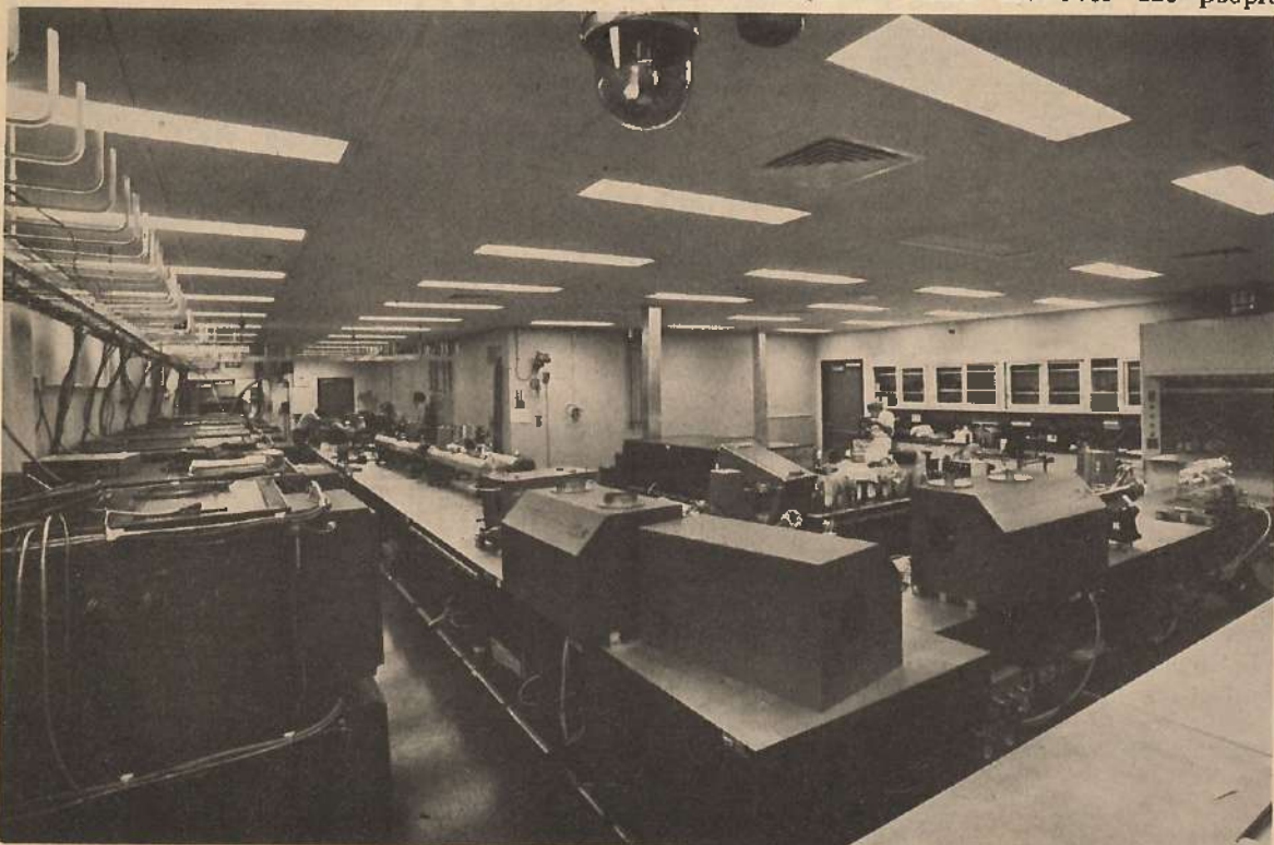
A complex optical bench. The laser fusion project makes use of the high degree of optics expertise available at Rochester.

Adopted from public information pamphlets prepared by the Laboratory for Laser Energetics.