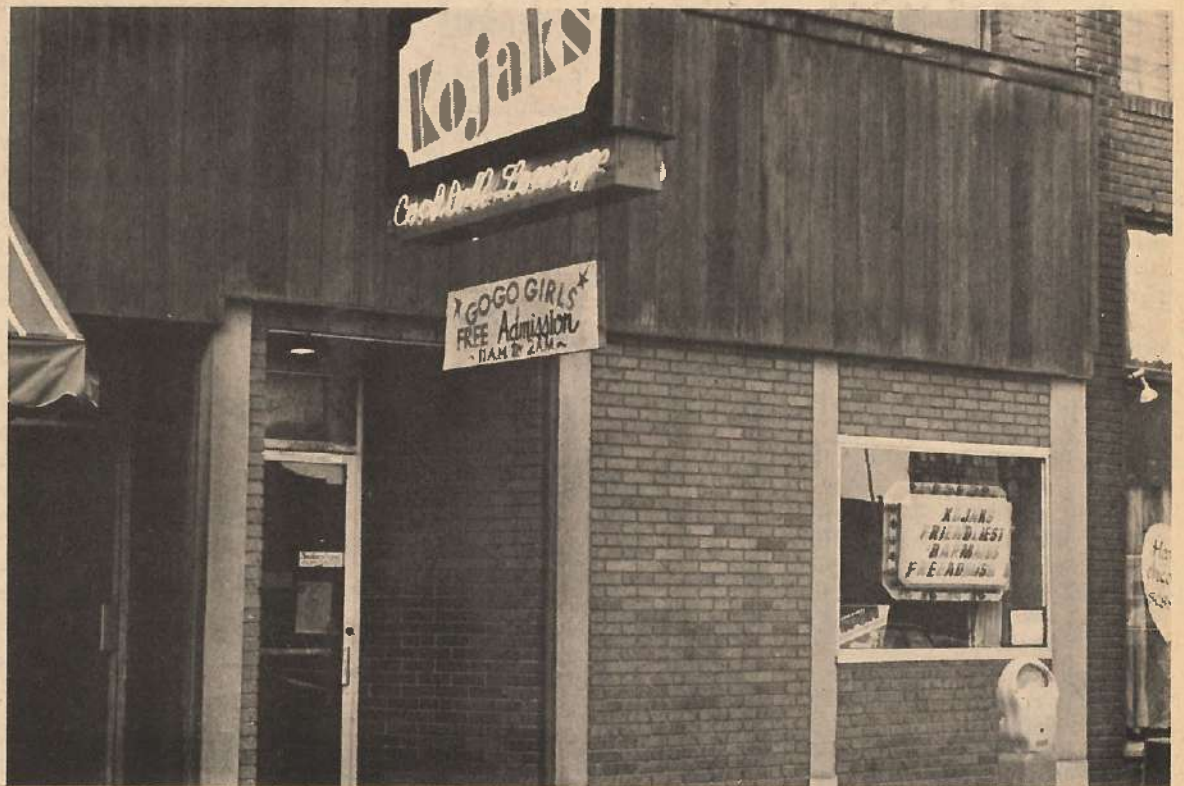
Kojak's promises . . . does it deliver?

When the hour ordeal was over, we proceeded to make friendly conversation with the cop. We asked him why he wasted his time on three innocent college students while there were pimps, prostitutes and pushers roaming the streets.