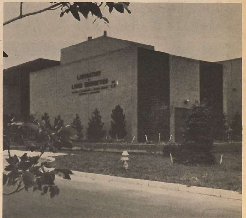
The Laboratory for Laser Energetics, located on the UR's South River Campus.

working in the LLE, and of those 75 are from the UR. The other 45 are on contract from private companies such as Eastman Kodak, and are primarily systems engineers.